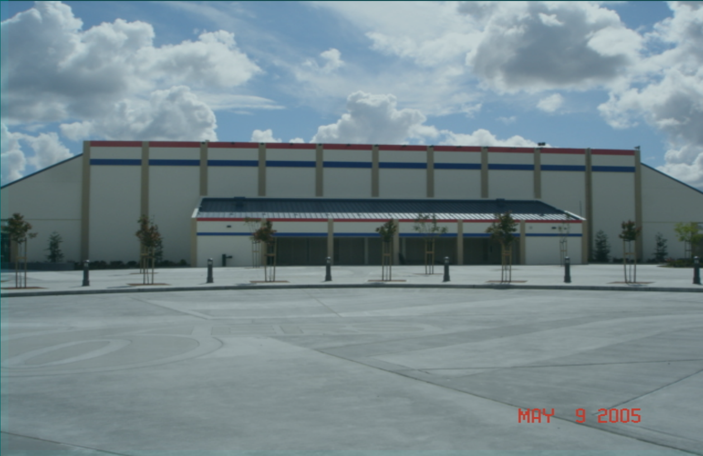
Gym Renovation ○ After