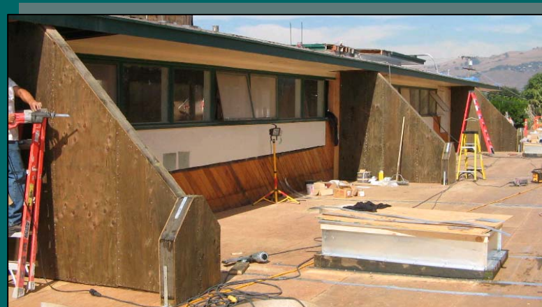
New Structural Wing Walls