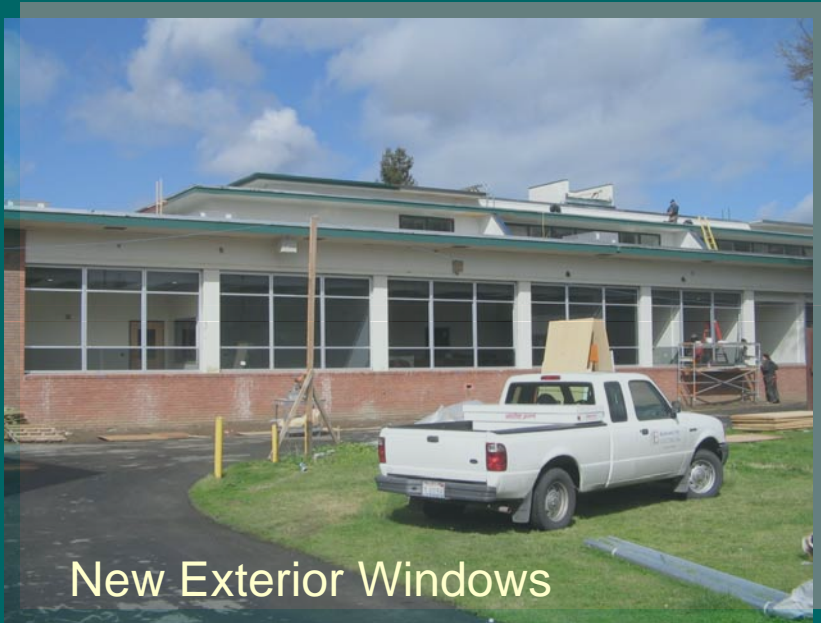
New Exterior Windows

(Project also Includes landscape/streetscape and Low Voltage Infrastructure upgrades)