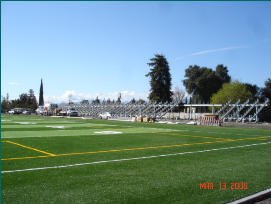
Track & Field Improvements